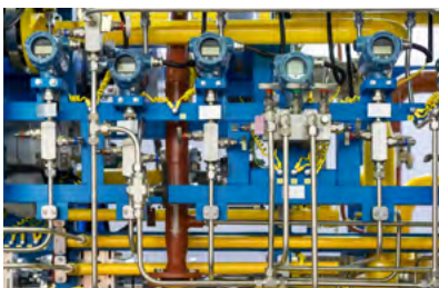
Flow control valves