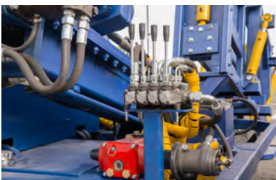
Pressure control valves