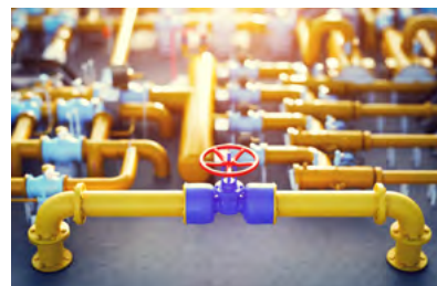
Directional control valves